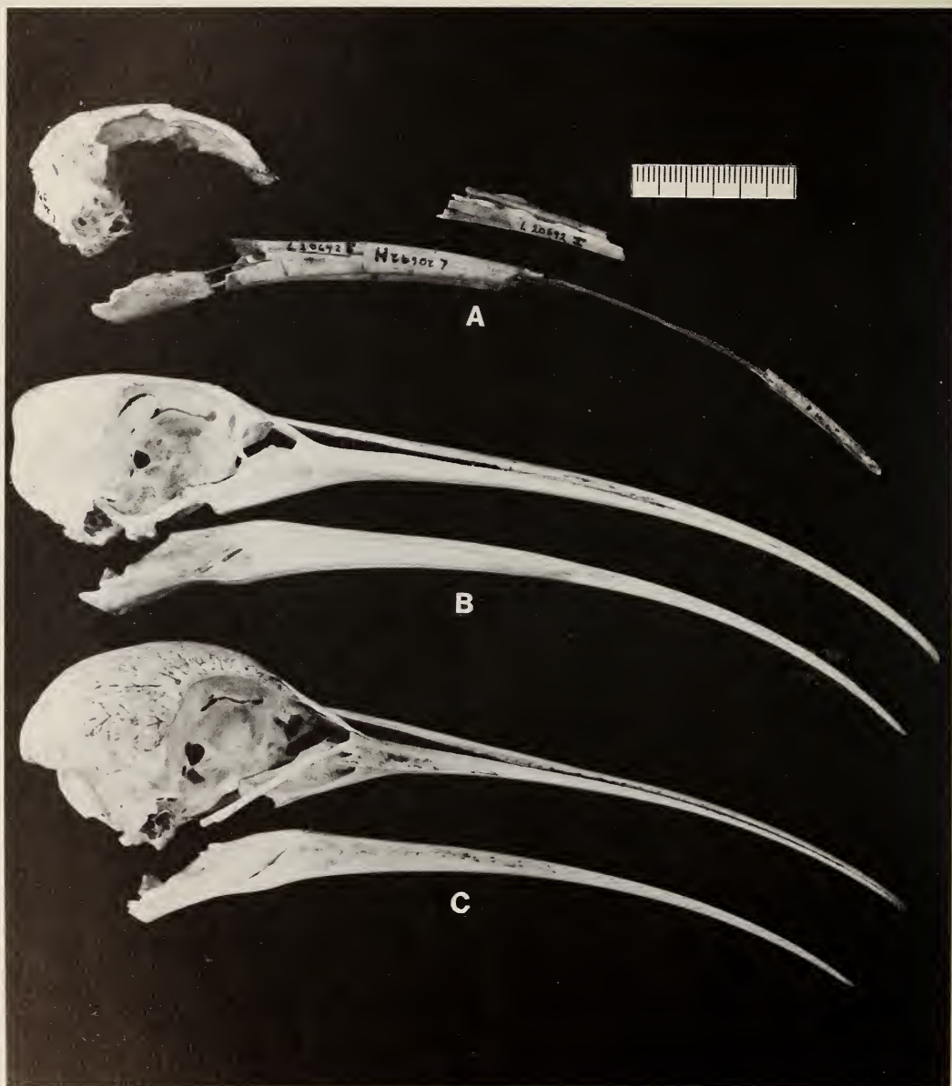
Fig. 1. Right lateral view of skulls and mandibles of Geronticus . A. G. apelex sp. nov., holotype, SAM-PQ-L20692. B. G. eremita , MVZ 155199. C. G. calvus , TM 33348. The occipital crest in G. eremita may be better developed in presumably older individuals but never approaches the condition in G. calvus . Scale is in mm.